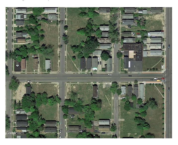
Figure 2: Corner lot shortcuts due to vacancy represent social opportunism in the transitional urban landscape.

environment to a new species" 2. It has also been suggested that one of the most important characteristics in defining invasibility it the fluctuating nature of resources within the environment 3. It is not a far stretch to imagine the loss of jobs or taxes (resources) leading to the urban condition that permitted various types of social opportunism like the corner cut-throughs (or vandalism, or a community land bank, or a mow-toown program). It is generally thought that low levels of invasibility are somehow preferable to high levels, especially if control is your primary agenda. However, we should consider, particularly in this conversation around transitional urban land, that both opportunism and invasibility could be useful strategies for designed engagement. Opportunism is dependent upon invasibility, so we could seemingly leverage this relationship in two possible ways. The first would be to initiate change by either finding or mobilizing new opportunistic forces that engage an existing context in an opportunistic way. For example, a species of tree was planted that only grew in railroad ballast, with the intention of it