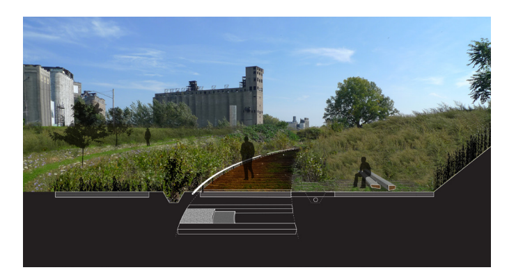
Figure 4: Section showing access paths and ditch/ridge landscape for vegetation dispersal.

of as a measurement of time between these two events. In particular processes (like urban transformation) however, lag can be considered an actual actor, generating physical space.