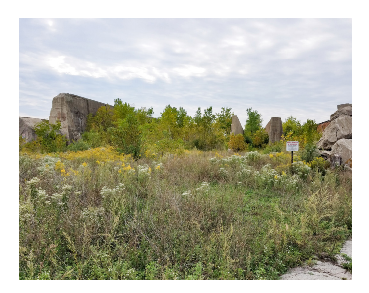
Figure 1: Opportunistic vegetation overtaking ore walls at Steelworkers Park in Chicago.