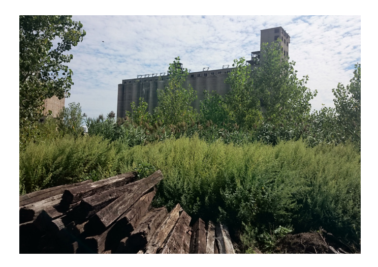
Figure 3: Layered opportunistic vegetation establishment based on existing topography and hydrology.